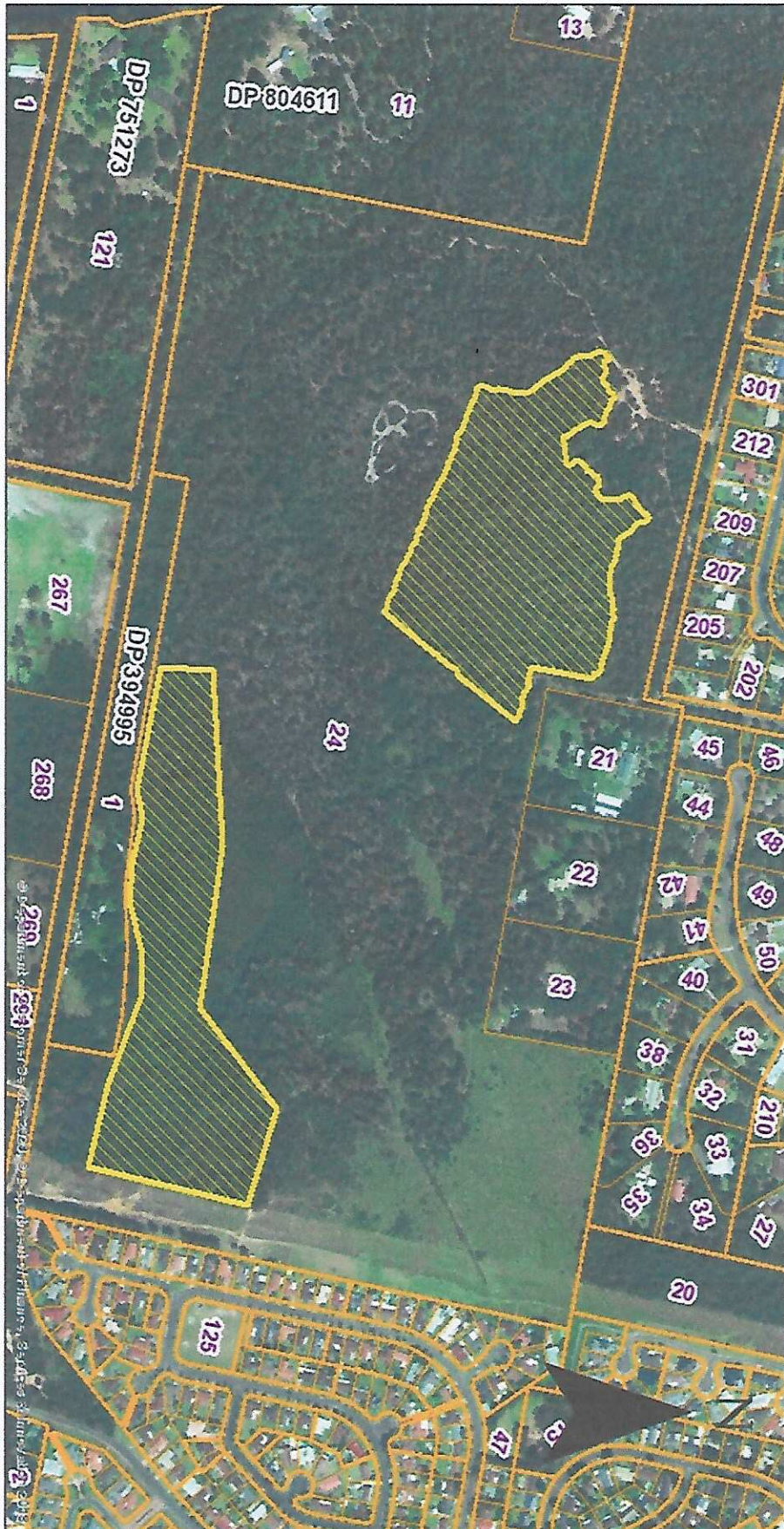
Attachment 1: Map of the Remediation Area